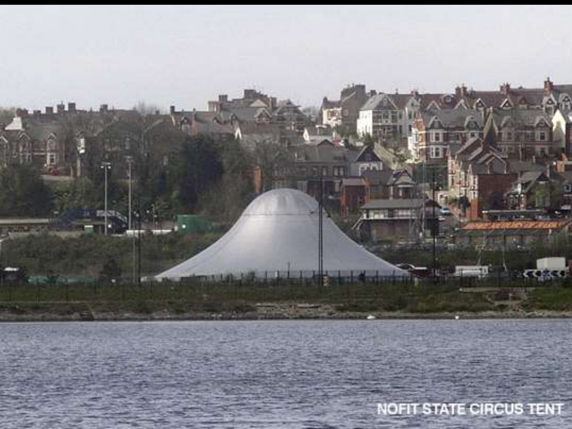
NOFIT STATE CIRCUS TENT