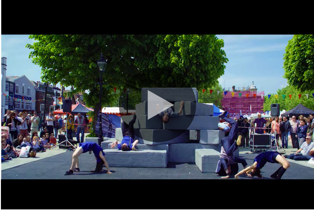
Block Trailer (2016)